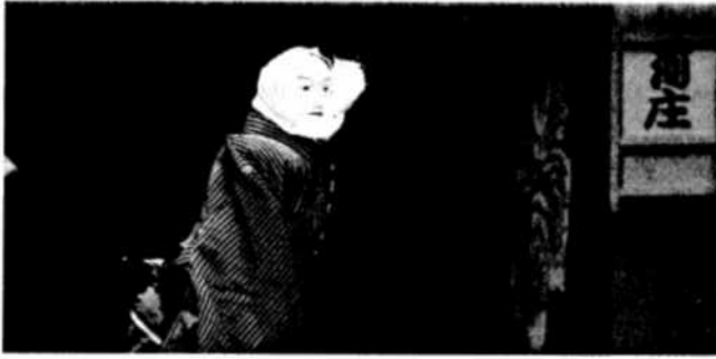
FIGURE 3.17. Jihei, searching for Koharu, approaches the Kawashō. He wears a white hand towel ( tenugui) around his head to suggest that he is avoiding public attention.

the lamp. In her heart she's thinking only of me. I'll signal her that I'm here, and we'll run off together. Then which will it be—Umeda or Kitano? 9 Oh—I want to tell her I'm here. I want to call her.