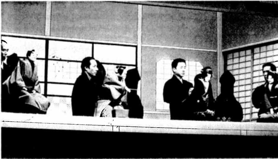
FIGURE 3.16. Tahei gestures with his pipe as he taunts Koharu. The proprietress is at stage left, and Tahei's friend is at stage right.

A man whose business is so tight he's at his wits' end every sixty days merely to pay the wholesalers' bills! Do you think he'll be able to fork over nearly ten kamme 3 to ransom you? That reminds me of the mantis who picked a fight with an oncoming cart! 4 But look at me—I haven't a wife, a father-in-law, a father, or even an uncle, for that matter. Tahei the Lone Wolf—that's the name I'm known by. I admit that I'm no match for Jihei when it comes to bragging about myself in the Quarter, but when it comes to money, I'm an easy winner. If I pushed with all the strength of my money, who knows what I might conquer? How about it, men? Your customer tonight, I'm sure, is none other than Jihei, but I'm taking over. The Lone Wolf's taking over. Hostess! Bring on the sake! On with the sake!