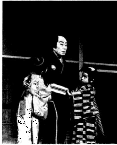
FIGURE 3.26. Jihei is left with his children after Osan's father drags her away. In the bunraku version, he picks up the younger one; in kabuki, two older children cling to him.

chanter sings, some palanquin bearers come and go, and a woman briefly comes out of a doorway.