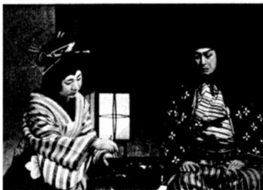
FIGURE 3.18. As they converse, Koharu prepares a pipe for her samurai client (actually Magoemon with a Kōmei head and a hood to disguise his identity). The bottom picture is a kabuki version of the same actions. The doll's obi is tied in the back, whereas in kabuki the obi is tied in the front. The pipe ( kiseru ) is an often used hand prop in both theaters.