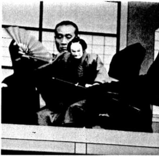
FIGURE 3.21. As he scolds his brother, Magoemon gestures with a fan, which has not been reduced to puppet scale. It is held by the puppeteer, whose hand is slipped through the doll's sleeve. The second puppeteer uses his left hand to hold the sword.

furiously over Tahei's face. Tahei, thoroughly trampled and covered with mire, gets to his feet and glares around him.