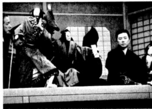
FIGURE 3.22. In the kabuki version, Magoemon swears to Koharu that he will not show Osan's letter to anyone. Below, in the bunraku version, Magoemon attempts to keep Jihei from attacking Koharu while indicating to Koharu his understanding of the importance of the letter.