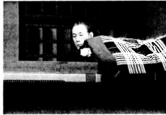
FIGURE 3.23. Act 2 opens with Jihei in bed while his wife, Osan, attends to the shop and their family.

[AUNT]: None of your evasions! Last evening at the Ten Nights service I heard the people in the congregation gossiping. Everybody was talking about the great patron from Temma who'd fallen in love with a prostitute named Koharu from the Kinokuni House in Sonezaki. They said he'd driven away her other guests and was going to ransom her in the next couple of days. There was all kinds of gossip about the abundance of money and fools, even in these days of high prices. My husband Gozaemon has been hearing about Koharu constantly, and he's sure that her great patron from Temma must be you, Jihei. He told me, "He's your nephew, but for me he's a stranger, and my