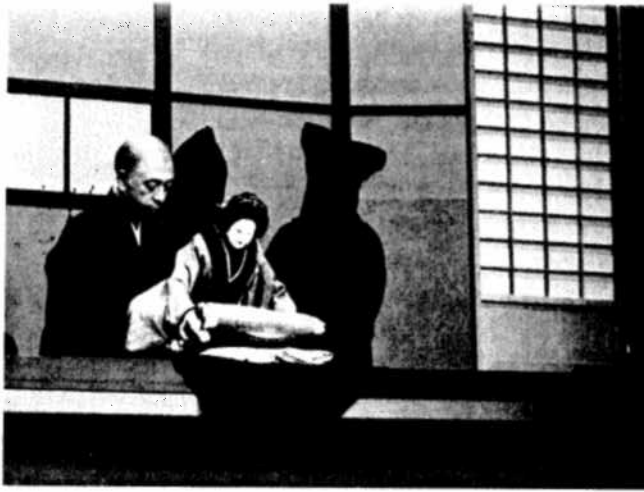
FIGURE 3.24. Osan takes her kimono from a chest and piles them on a large cloth for Jihei to pawn.

are ended and I can no longer stay by your side. If my master is induced by Tahei's money to deliver me to him, I'll kill myself in a way that'll do you credit!" But think—not ten days have passed since I broke with her, and she's to be redeemed by Tahei! That rotten whore! That animal! No, I haven't a trace of affection left for her, but I can just hear how Tahei will be boasting. He'll spread the word around Osaka that my business has come to a standstill and I'm hard-pressed for money. I'll meet with contemptuous stares from the wholesalers. I'll be dishonored. My heart is broken, and my body burns with shame. What a disgrace! How mad-