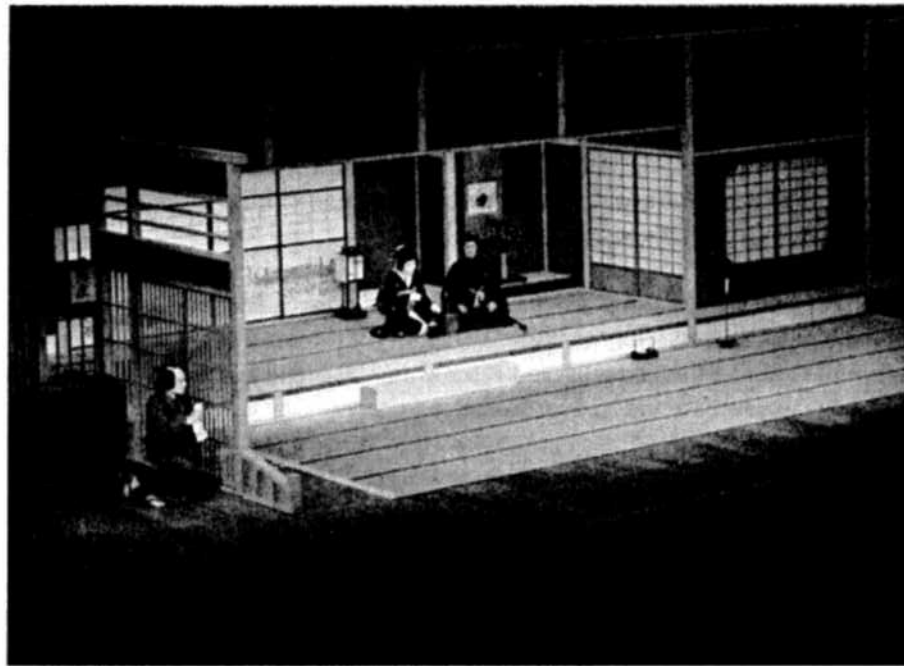
FIGURE 3.15. The kabuki setting for act 1, scene 2, of The Love Suicides at Amijima is similar to that used in bunraku. There is no curtained exit at stage right, and the lattice window is replaced with a lattice door through which Jihei (played in the wagoto style) is spying on Koharu and her mysterious samurai customer. Compare this with figure 3.39.

[KOHARU]: Oh—you can be heard as far as the gate. Please don't call me Koharu in such a loud voice. That horrible Ri Tōten 2 is out there. I beg you, keep your voice down.